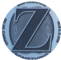
COMPETITOR 2 600 DPI